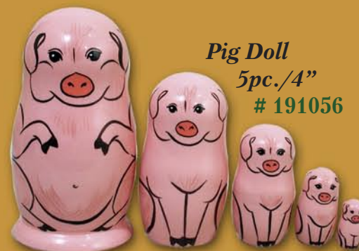
Pig Doll 5pc./4" # 191056