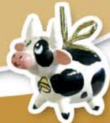
Holstein Cow #314910