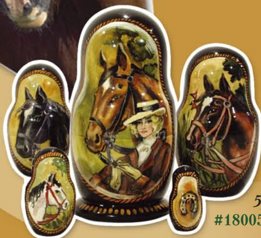
English Horse 5pc./6" #180055