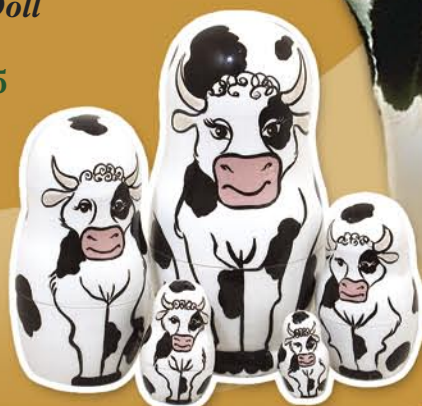
Holstein Cow Doll 5pc./4" #191053