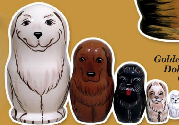
Golden Retriever Doll 5pc./4"

Golden retriever, red dachshund, Schnauzer, spaniel, and Eskimo dog puppy. #181050