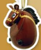
Horse We stock bay and dappled gray. #314911-HR