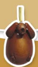
Dachshund An overfed wiener dog belongs in every house! Hang this one on your tree. #314911-D