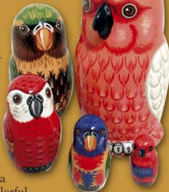
Parrot Doll 5pc./6" A bevy of tropical birds nests inside this dramatic cockatoo, making a most colorful 5-piece nesting doll. You can add it to your matryoshka collection for a song! And the best thing: there are no cages to clean! #190054-P