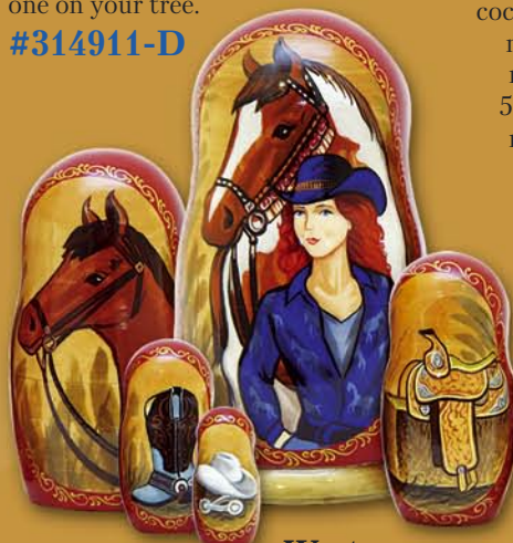
Western Horse Doll 5pc./6" #181055